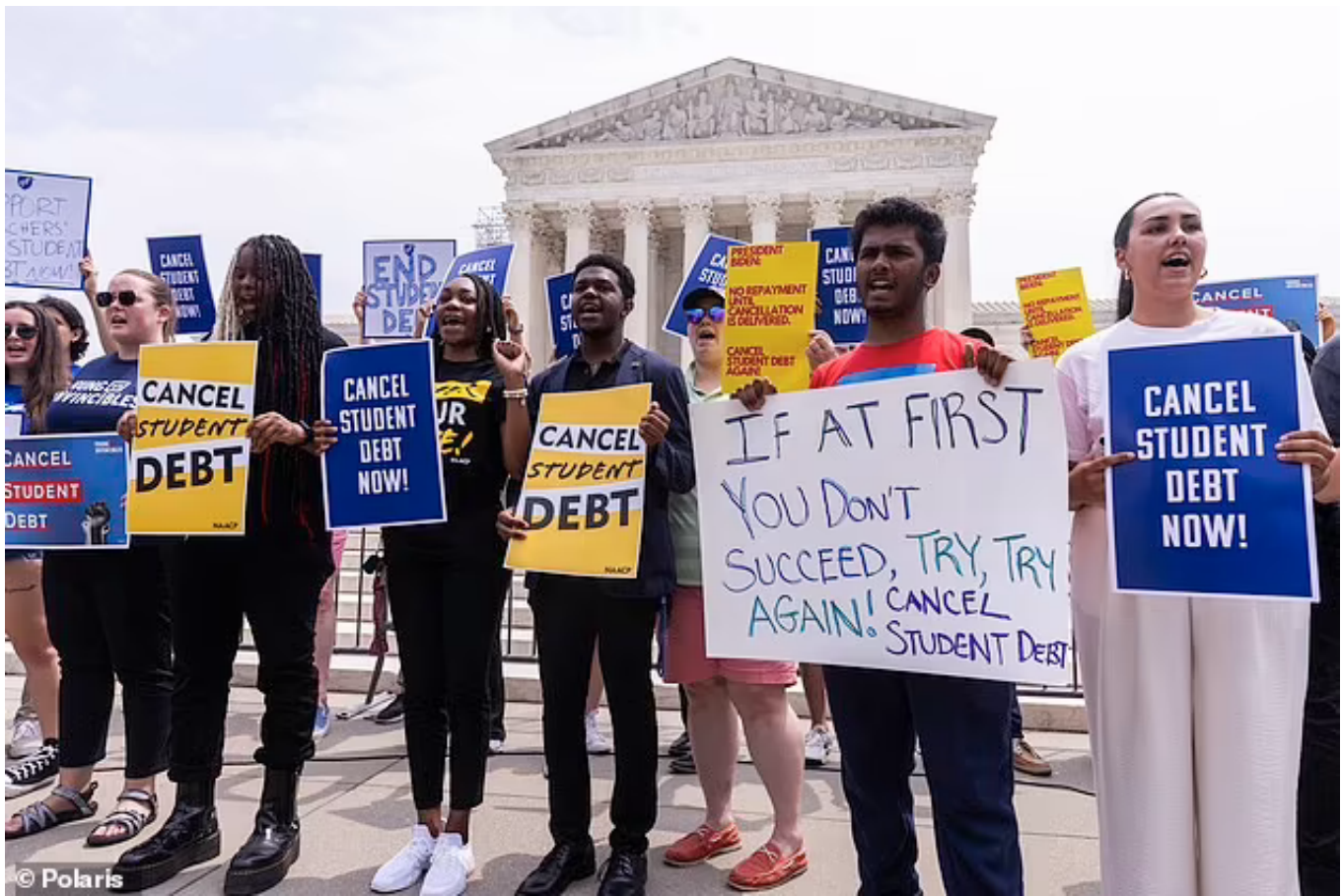
Protesters holding signs advocating for the cancellation of student debt stand in front of the United States Supreme Court in Washington DC on Friday, June 30, 2023