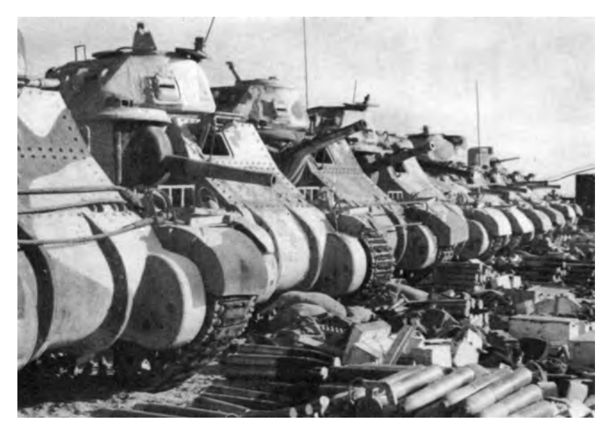
A period of relative inactivity.

Allied shipping to travel far to the south around the tip of Africa, thus lengthening the time required to supply American and British forces in the China, Burma, India (CBI) Theater of Operations.