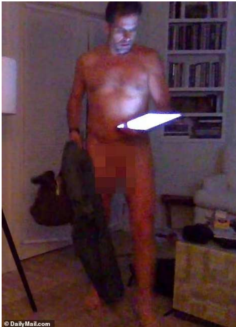
Hunter and the women made sex tapes of their night of debauchery. Here is a screen grab from the video of a naked Hunter