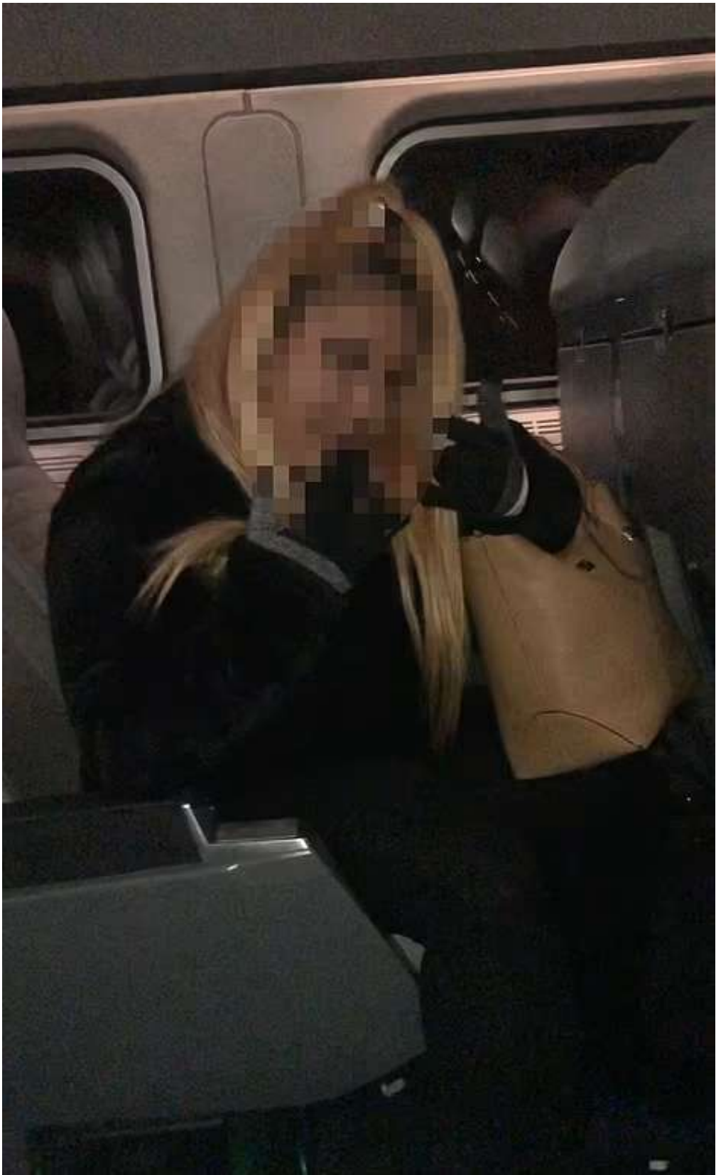
The women sent videos to Hunter show them on the train after he paid for their ticket to New York for their illicit hookup