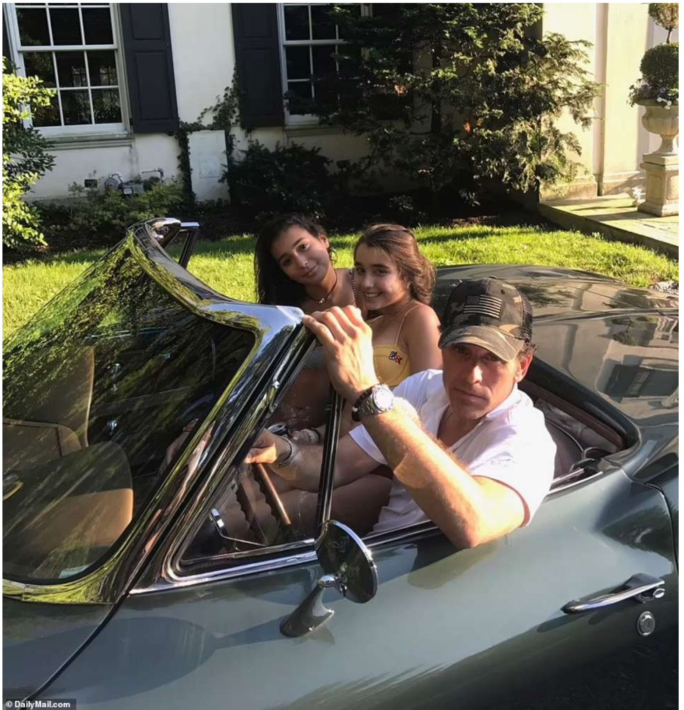
DailyMail.com obtained a photo of Hunter Biden outside his dad Joe's Delaware home the day he sent damning texts to his Chinese business partner