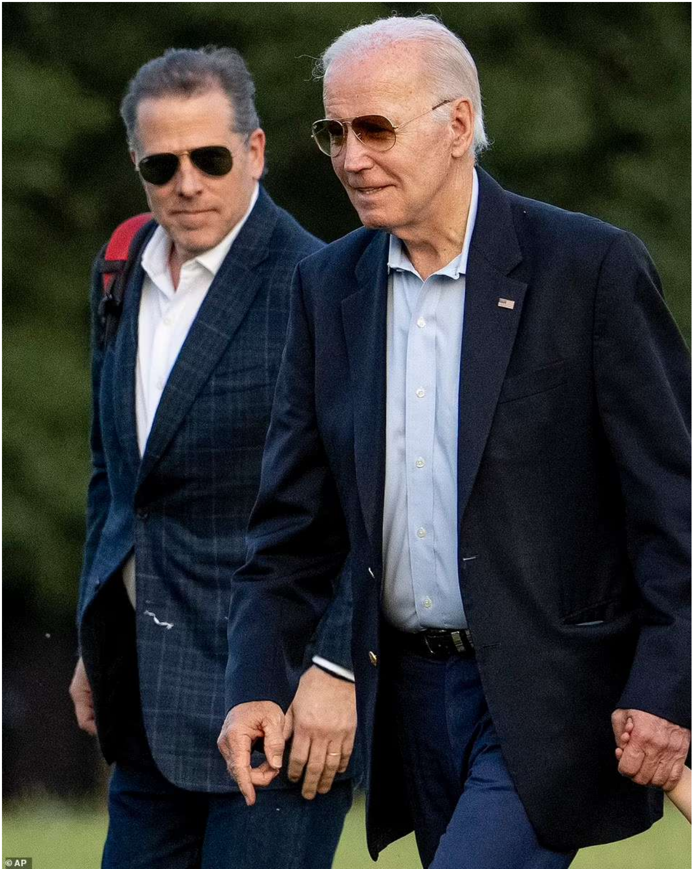
Emails, texts, photos and documents unearthed by DailyMail.com have added to a still-growing body of evidence suggesting Joe had ties to his son Hunter's shady business dealings