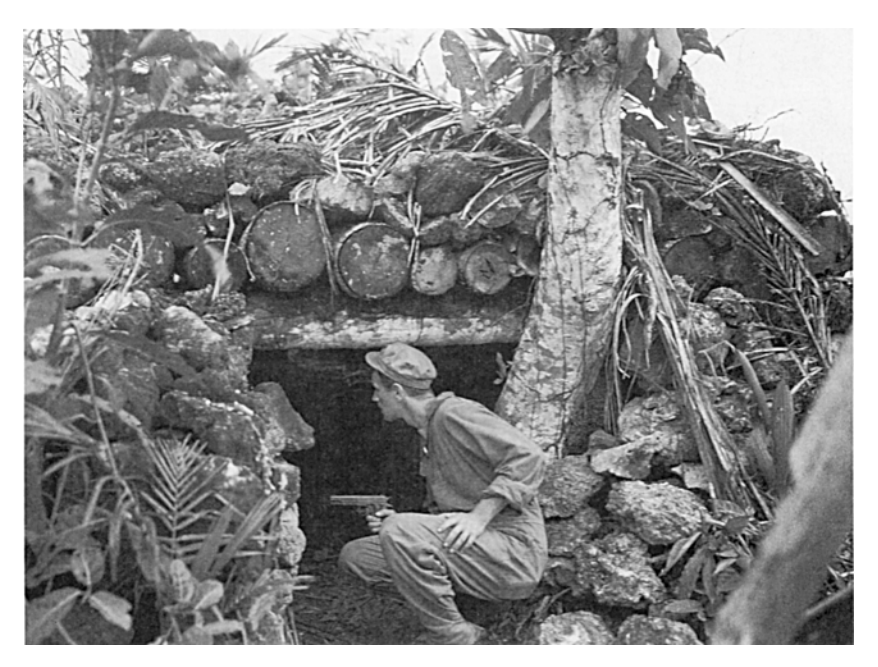
A typical Japanese pillbox.

Most foreboding was information from the 172d Infantry, which, with the support of Marine tanks, had cleared the Laiana beachhead of Japanese during the logistic buildup. These operations revealed the nature of the main Japanese defenses: machine gunners and riflemen ensconced in sturdy pillboxes with interlocking fields of fire. The pillboxes were tough obstacles. Constructed with three or four layers of coconut logs and several feet of coral, they were largely subterranean. The few feet exposed above ground contained machine-gun and rifle firing slits, so well camouflaged that American soldiers often could not determine their location.