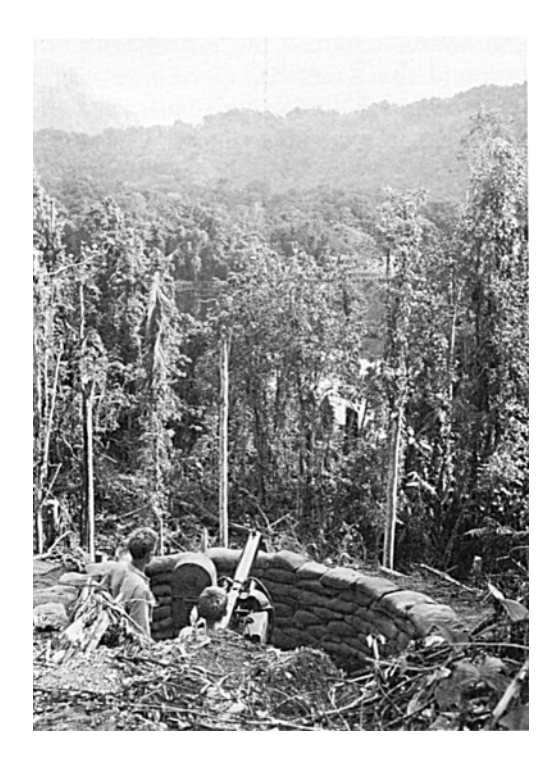
Machine gun crew awaits the Japanese attack on Bougainville.

Hill 700, the first Japanese target, was a commanding position with 65- to 75-degree slopes situated at the eastern end of the 145th Infantry's sector. The sector stretched 3,500 yards west past the southern shore of a lake and ended in low ground near the intersection of a major inland trail with the American perimeter. There, on its left, the 145th tied in with the 129th Infantry.