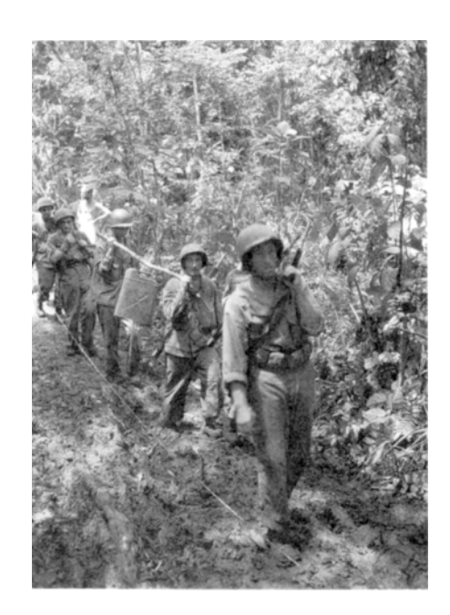
Men of the 148th Infantry carry hot food forward.

Ominously, there now appeared the first large number of shaken, hollow-eyed men suffering from a strange malady, later diagnosed as "combat neuroses." Before the end of July, the 169th would suffer seven hundred such cases of battle fatigue.