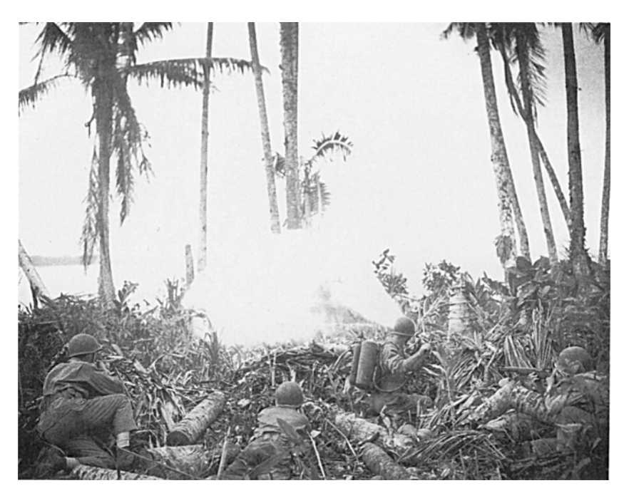
Flamethrowers in action at Munda.

which made the position visible amidst the jungle growth, if not destroying it outright. Next 81-mm. mortars, using heavy shells with delay fuzes, would fire on visible positions. Finally, a platoon or company assaulted, supported by whatever heavy weapons were available. When full reconnaissance was not possible, troops had to attack the terrain—seize and occupy pieces of ground while calling in mortar fire on likely pillbox sites. A tactic of necessity, attacking the terrain could be risky against more than light opposition. The operations officer of the 145th Infantry noted, "Enemy strong points encountered in this fashion often times resulted in hasty withdrawals which were costly both in men and weapons."