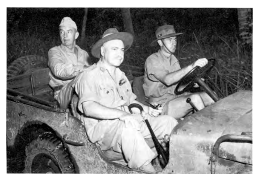
General Blamey tours the battle area with General Eichelberger (left).

requires a machete to cut through it. Knife-edged kunai grass up to 7 feet high, reeking swamps full of leeches and malarial mosquitoes, and a slippery ground surface under dripping vegetation add to the formidable obstacle course.