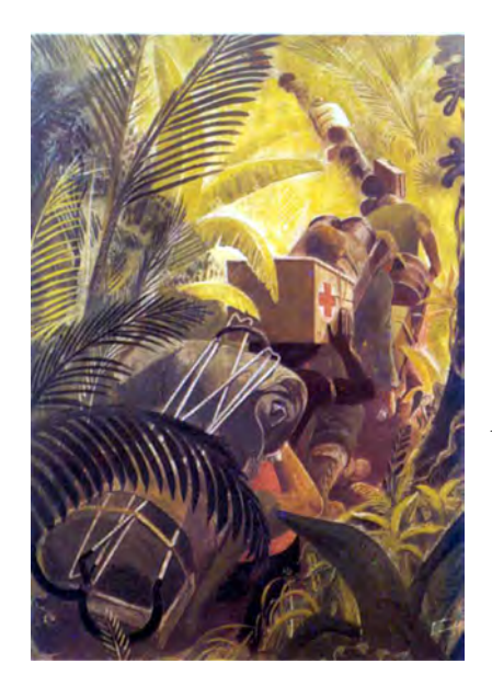
"Jungle Trail" by Franklin Boggs. Thick jungles of the Southwest Pacific Area made resupply an arduous process. (Army Art Collection)

Battalion of the 126th Infantry, setting out from Port Moresby, would turn inland at Kapa Kapa and move through the mountains to Jaure on a track parallel to, but thirty miles southeast of, the Australians. On the third axis, the 18th Australian Infantry Brigade, fresh from victory at Milne Bay, would sweep the north coast of the island and meet the U.S. 128th Infantry, airlifted from Port Moresby, at Wanigela. The two units would then cross Cape Nelson and stage at Embogo for the assault on enemy lines less than ten miles away.