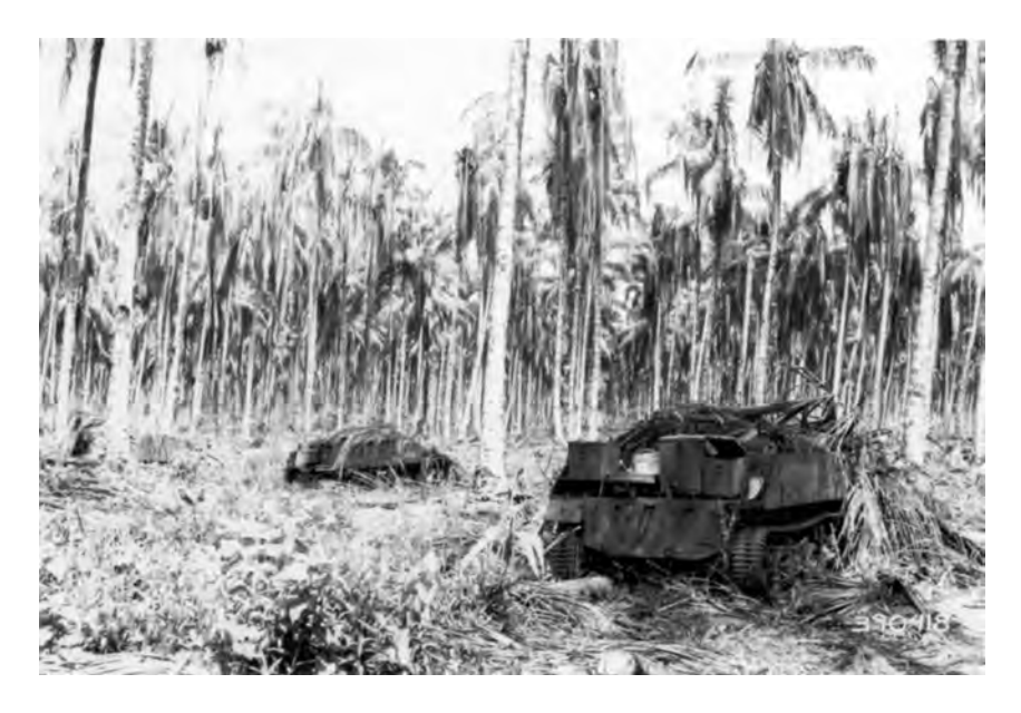
Disabled Bren gun carriers at Duropa Plantation.

air attack and delayed ship-to-shore movement of troops and supplies. In search of more reliable air and amphibious support, MacArthur decided to organize a new unit for future campaigns: the engineer special brigade. These brigades would soon carry troops and equipment ashore, organize beaches, and construct airfields.