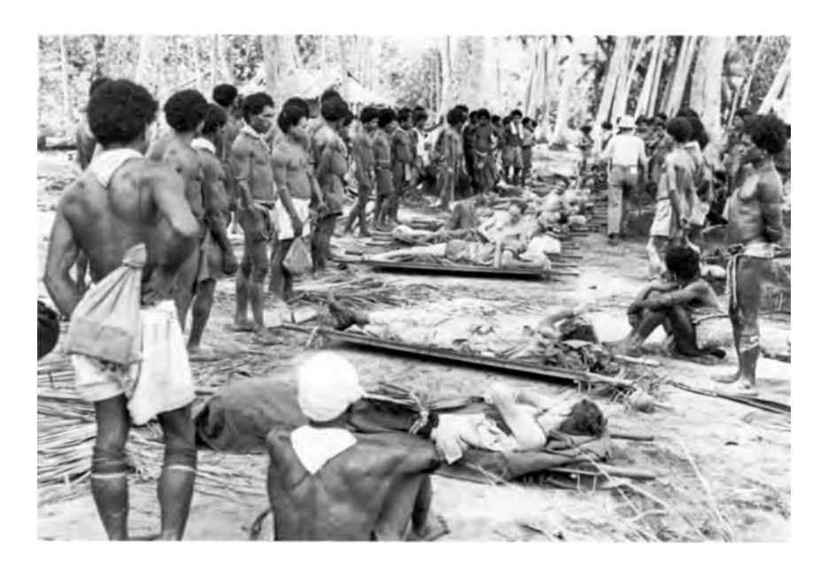
American and Australian casualties, with Papuan litter bearers.

each bunker and jam hand grenades into firing slits, a process both slow and costly in casualties.