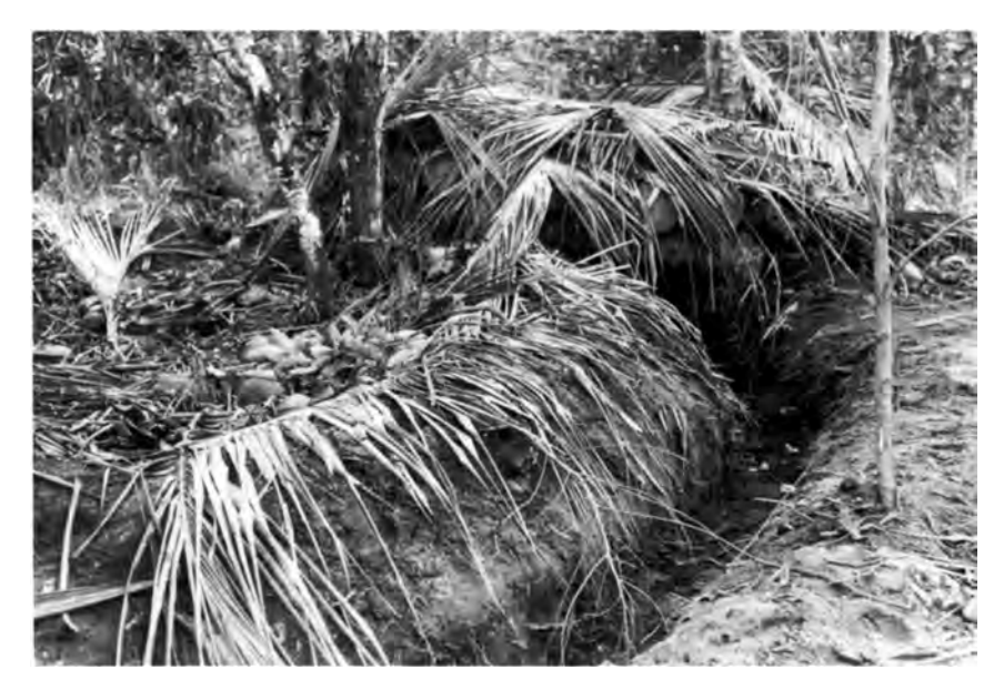
Coconut log bunker with fire trench entrance in the Buna Village area.

tory since Milne Bay in early September. Good news soon followed from the Urbana front. On 14 December the U.S. 3d Battalion overran Buna Village, pushing the remaining enemy into Buna Mission.