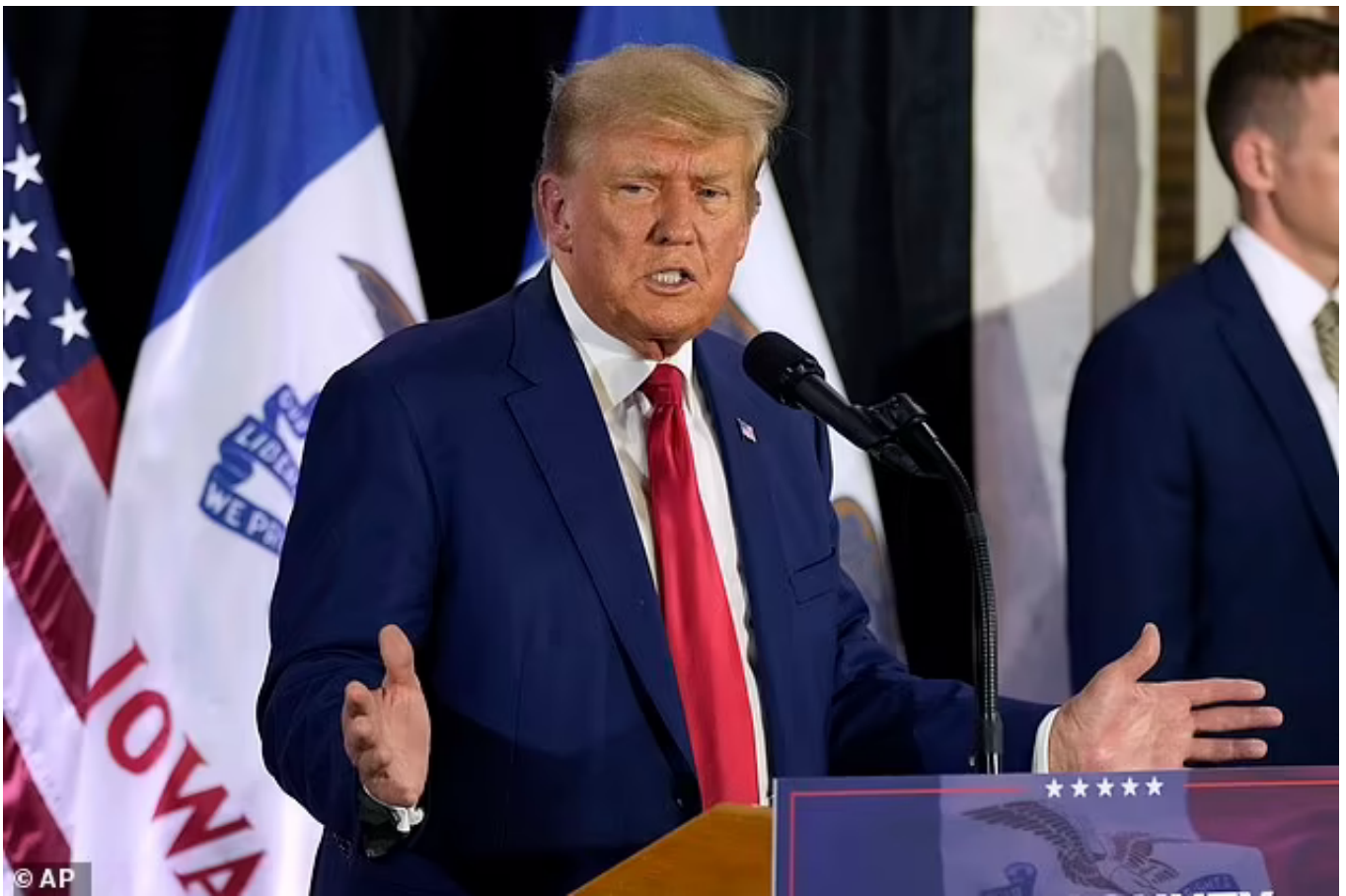
Former President Donald Trump faces possible indictment related to his election overturn effort. Prosecutors on Thursday filed a superseding indictment in his classified documents case