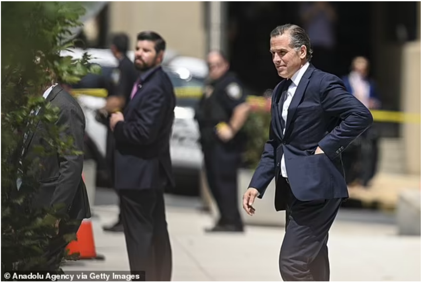
First son Hunter Biden had his plea del collapse in federal court in Wilmington Wednesday