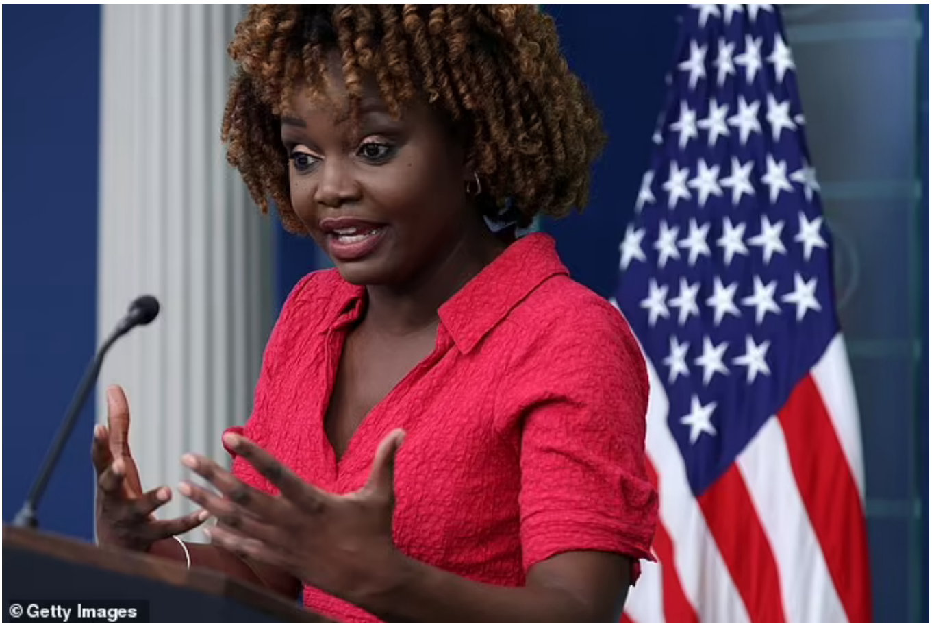
White House Press Secretary Karine Jean-Pierre quoting approvingly from an Atlantic piece that said Biden had made gaffes during his entire career